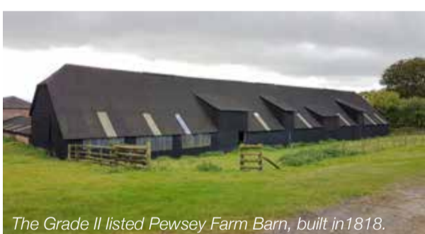
The Grade II listed Pewsey Farm Barn, built in 1818.

© Crown copyright 2025 Ordnance Survey AC0000866844 Leaflet © Pewsey Vale Tourism Partnership