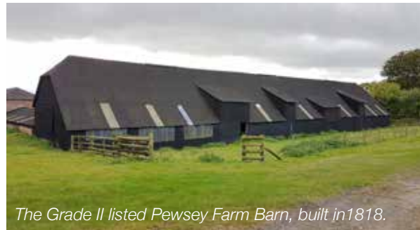
The Grade II listed Pewsey Farm Barn, built in 1818.