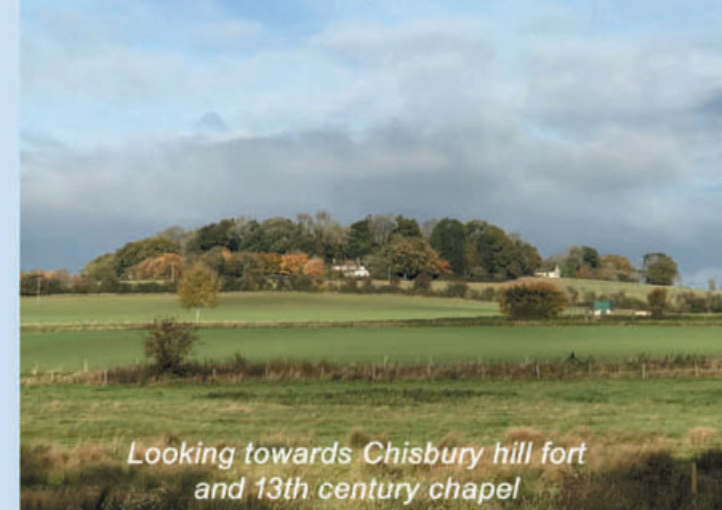
Looking towards Chisbury hill fort and 13th century chapel

Ensure that you are suitably equipped for walking. Note that these maps are intended as a guide only. Please respect the countryside, wildlife and livestock. Be aware that ticks are prevalent in the area.