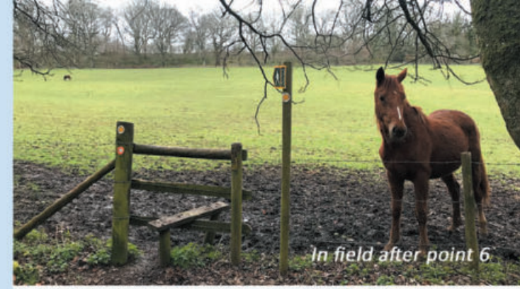
In field after point 6