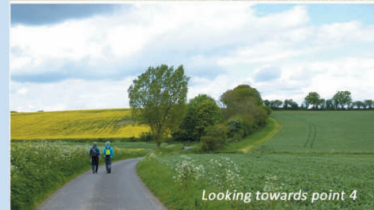
Looking towards point 4

Make sure that you are suitably equipped for walking and note that these maps are intended as a guide only. Please respect the countryside, wildlife and livestock, and ensure that dogs are kept under close control and don't leave the path. Be aware that ticks are prevalent in the area.