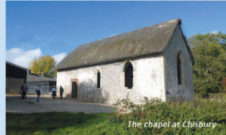
The chapel at Chisbury