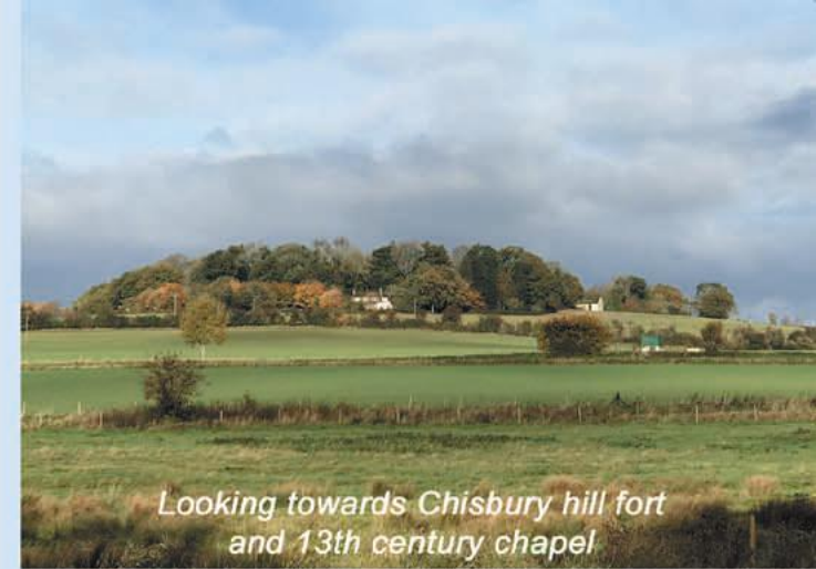
Looking towards Chisbury hill fort and 13th century chapel

Ensure that you are suitably equipped for walking. Note that these maps are intended as a guide only. Please respect the countryside, wildlife and livestock. Be aware that ticks are prevalent in the area.