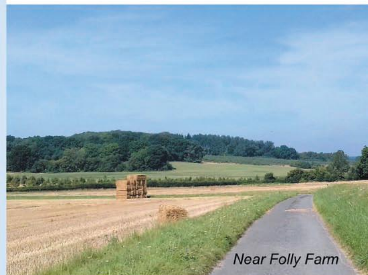
Near Folly Farm