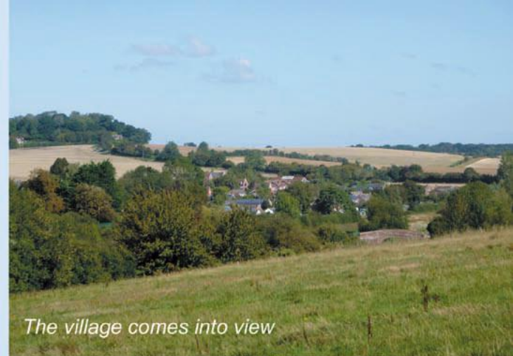
The village comes into view

Ensure that you are suitably equipped for walking. Note that these maps are intended as a guide only. Please respect the countryside, wildlife and livestock. Be aware that ticks are prevalent in the area.