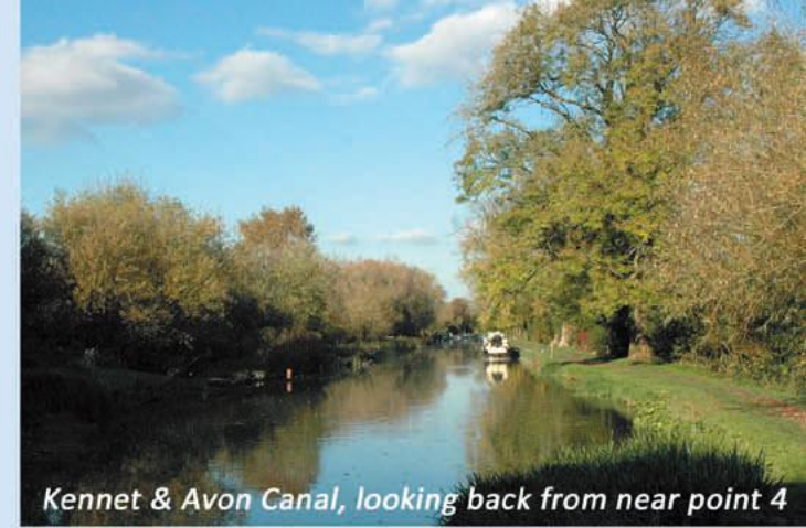
Kennet & Avon Canal, looking back from near point 4