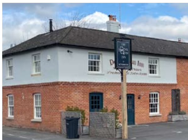
Start and finish at the Dog & Gun Inn on the A345