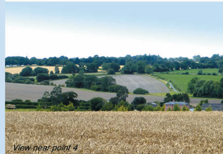
View near point 4