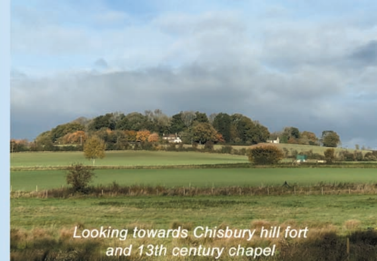
Looking towards Chisbury hill fort and 13th century chapel

Ensure that you are suitably equipped for walking. Note that these maps are intended as a guide only. Please respect the countryside, wildlife and livestock. Be aware that ticks are prevalent in the area.