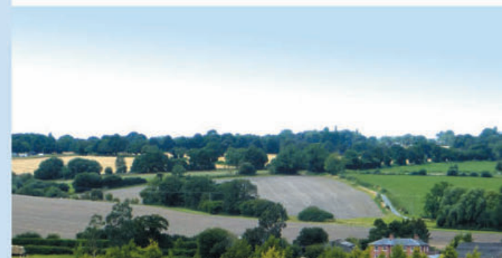
View near point 4