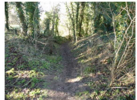
Footpath approaching East Chisenbury 8