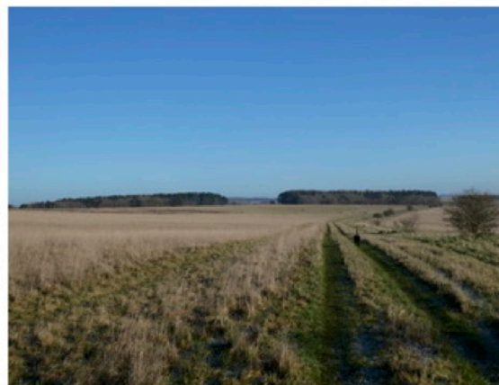
Ridge-line above Rainbow Bottom heading for 2