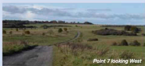
Point 7 looking West

The Start Point is the Weatherhill Firs Car Park, 1km south of the A342 and Netheravon Road junction in Everleigh. There is ample parking.