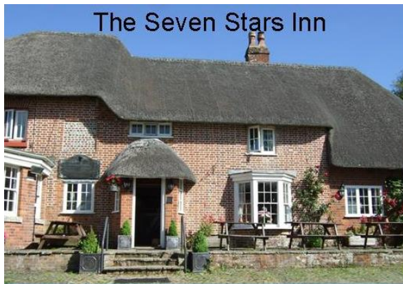
The Seven Stars Inn