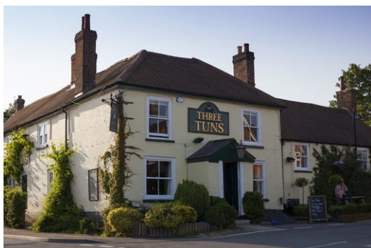
The Three Tuns