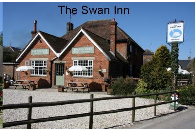
The Swan Inn