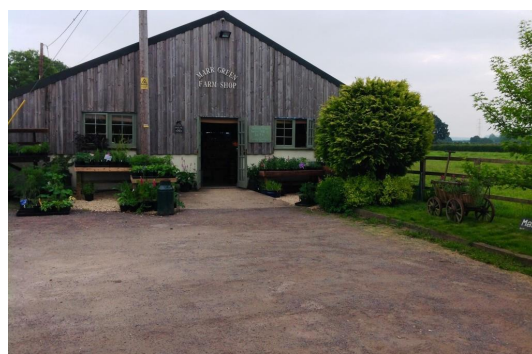
Marr Green Farmshop