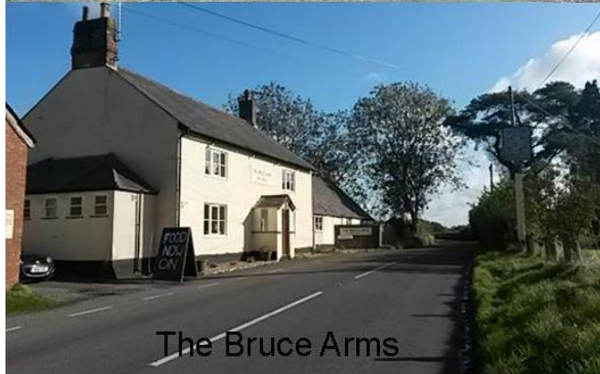
The Bruce Arms