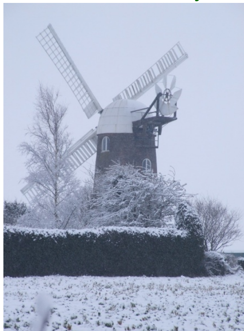
Wilton Windmill in the snow

Wishing you a Merry Christmas & prosperous New Year from the Visit Pewsey Vale team!