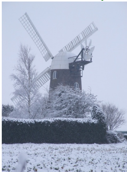
Wilton Windmill in the snow

Wishing you a Merry Christmas & prosperous New Year from the Visit Pewsey Vale team!